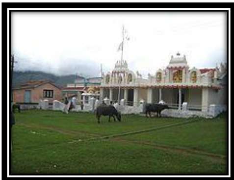
Cattle at a temple, in Ooty , India

Prithu chasing Prithvi , who is in the form of a cow. Prithu milked the cow to generate crops for humans.