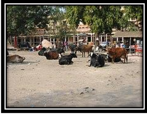
Cattle making themselves at home on a city street in Jaipur, Rajasthan