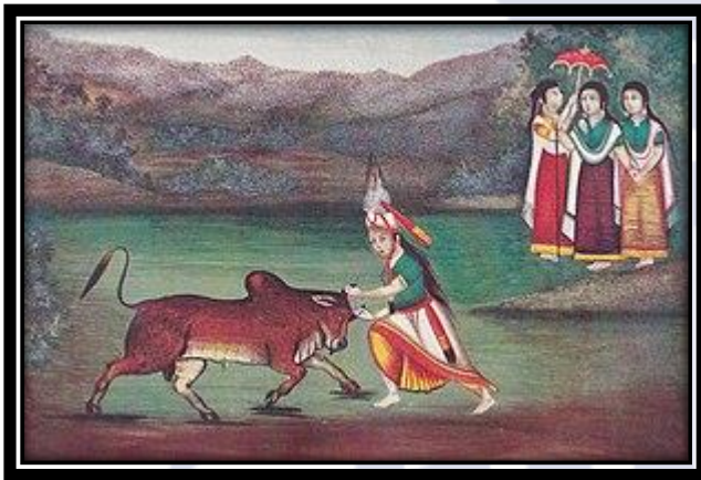
A painting depicting Cow, being captured by hero Khuman Khamba